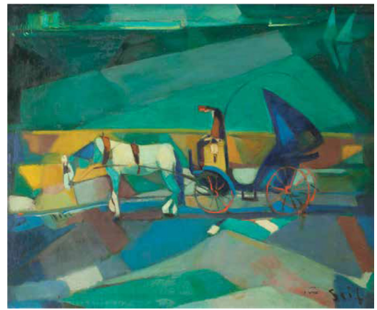
Seif Wanly (Egyptian, 1906–1979), Nocturne, 1953.