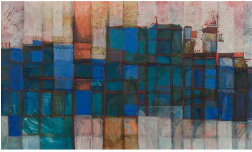
Asaad Arabi (Syrian, born 1941), Red Lines, ca. 1969