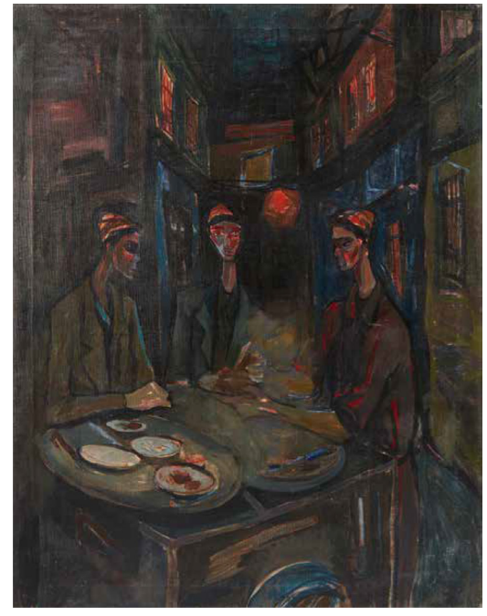
Mahmoud Sabri (Iraqi, 1917–2012), Untitled, ca. 1950.